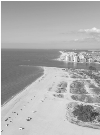
CONDO IN THE MEREDIAN SAND KEY