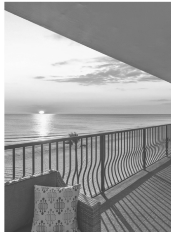
MADEIRA SANDS CONDO MADEIRA BEACH