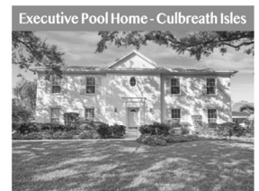
Executive Pool Home - Culbreath Isles 4913 ANDROS DR, TAMPA 33629 5 Bed | 3.5 Bath | 4,448 SF | $15,000 Month