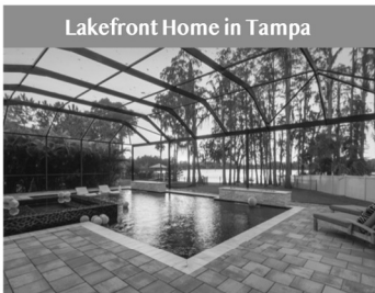
Lakefront Home in Tampa 16526 BALLYSHANNON DR, TAMPA 33624 5 Bed | 4.5 Bath | 4,306 SF | $1,625,000