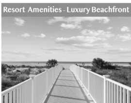
Resort Amenities - Luxury Beachfront MERIDIAN ON SAND KEY CONDO 2 Bed | 2 Bath | 1,756 SF | $995,000