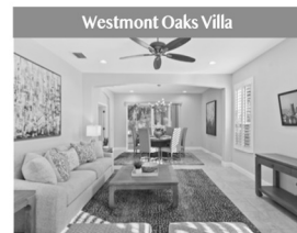
Westmont Oaks Villa 8562 ACORN RIDGE CT, TAMPA 33625 3 Bed + Office | 2 Bath | 1,779 SF | $485,000