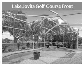
Lake Jovita Golf Course Front 12648 LAKE JOVITA BLVD DADE CITY 4 Bed | 3 Bath | 2,749 SF | $725,000