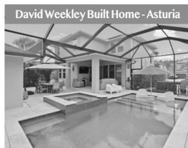
David Weekley Built Home - Astoria 14948 RENAISSANCE AVE, ODESSA 33556 3 Bed + Loft | 2.5 Bath | 2,442 SF | $730,000