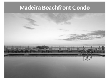
Madeira Beachfront Condo MADEIRA SANDS CONDO - MADEIRA BEACH 3 Bed | 2 Bath | 1,480 SF | $995,000

From Our family to Yours — Wishing You a HOME Filled with WARMTH & LOVE this Holiday Season .