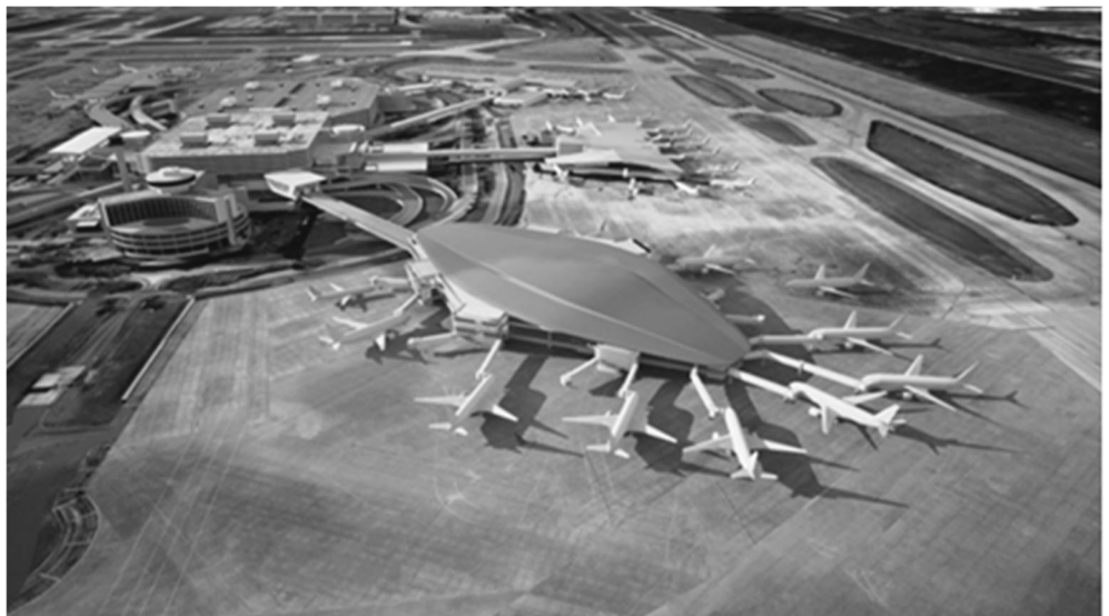
ARTIST RENDERING OF AIRSIDE D