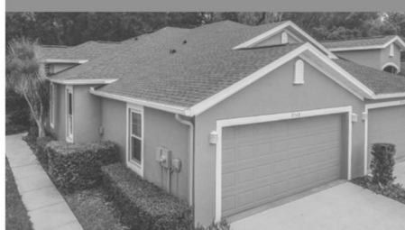
WESTMONT OAKS VILLA

8548 ACORN RIDGE CT. | TAMPA 2 Bed | 2 Bath | 1,484 SF | $425,000