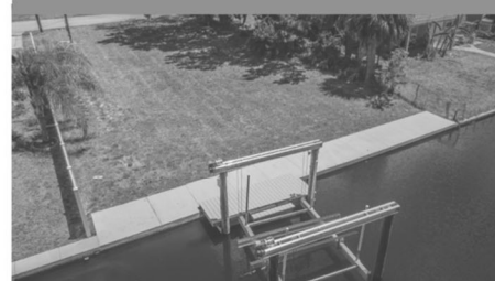
WATERFRONT LOT - GULF OF MEXICO

0 DULEY AVE. | HUDSON Vacant Lot | 58 x 100 | $245,000