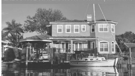
EXECUTIVE WATERFRONT - Price Improvement!

3952 VERSAILLES DR | DANA SHORES 5 Bed | 3 Bath | 4,189 SF | $2,150,000