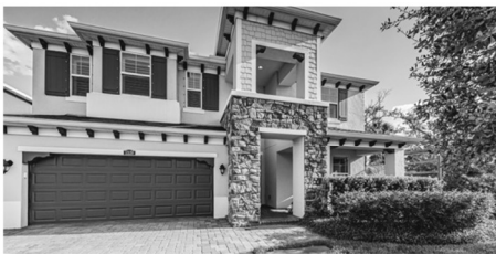
12120 RUSTIC RIVER WAY | TAMPA 4 Bed | 4 Bath | 3,308 SF | $1,100,000