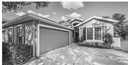
10711 ASHFORD OAKS DR. | TAMPA 2 Bed | 2 Bath | 1,377 SF | $413,000