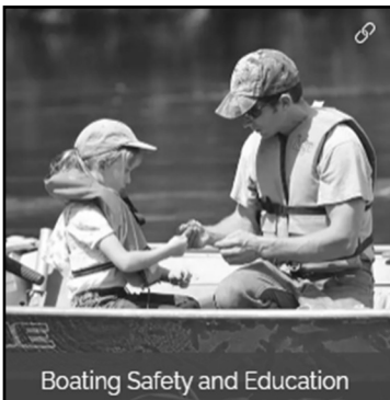
Boating Safety and Education

We can make the most of our time on the water when we feel comfortable and can help ensure safety for our friends and family members. According to a Florida Fish and Wildlife Conservation Commission (FWC) news release, 83% of Florida's boating deaths in 2021 occurred on boats where the boat operator had never received educational instruction.