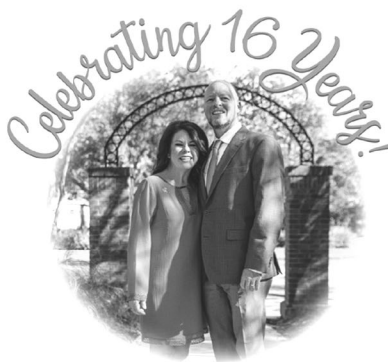
The Wood Team | Smith & Associates Real Estate