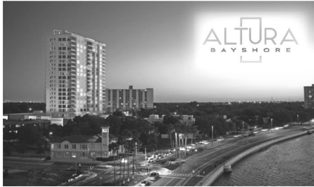
SOUTH TAMPA ALTURA BAYSHORE $1.2-3.2M | 2,167-3,575 SF 73 Residences