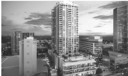
ST. PETE SALTAIRE $869,000-$7.6M 1,663-6,067 SF | 35 Stories