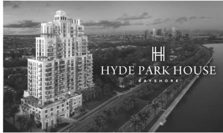
SOUTH TAMPA HYDE PARK HOUSE $999,000-$6.6M 1,835-5,057 SF | 22 Stories