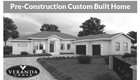
Pre-Construction Custom Built Home