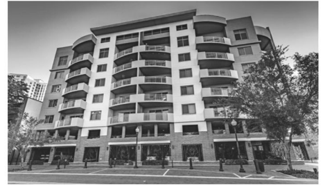
DOWNTOWN TAMPA 1108 N. FRANKLIN ST., #707 3 Bed | 3 Bath | 2,501 SF | $695,000