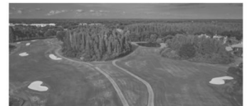
LAKE JOVITA GOLF COURSE 12648 Lake Jovita Blvd. | $435,000