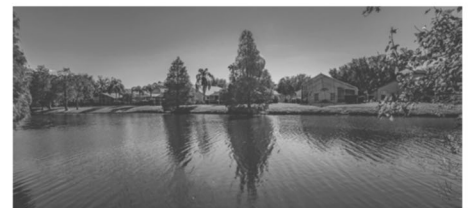
WATER VIEWS IN WESTCHASE! 9918 Stockbridge Drive 3 Bd | 2 Ba | 1,935 SF | $385,000