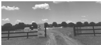
STEEPLECHASE NEW CONSTRUCTION 17130 Breeders Cup Dr. | $3,685,000