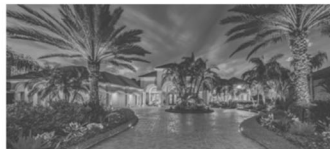
CHEVAL GOLF COURSE 5707 TPC Blvd. | $1,460,000