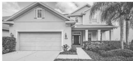
CLASSIC BEAUTY IN SOUTH TAMPA! 3205 Lake Green Court 4 Bd | 2.5 Ba | 2,678 SF | $579,900