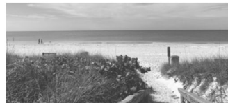
VINA DEL MAR WATERFRONT 201 Isle Drive | $795,000