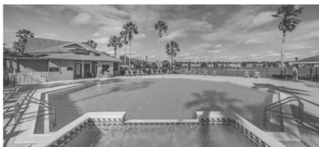
WATER VIEWS IN LAKE CHASE! 9022 Lake Chase Island Way 3 Bd | 2 Ba | 1,578 SF | $220,000