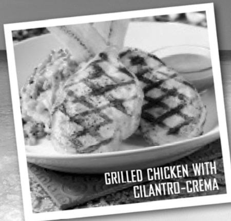
GRILLED CHICKEN WITH CILANTRO-CREMA

LIGHT, FRESH CUISINE IN A DELICIOUSLY LAID-BACK ATMOSPHERE.