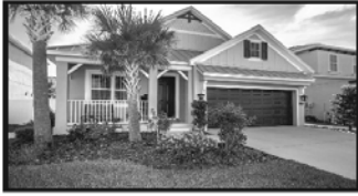
7704 S. De Soto St. PORT TAMPA

...from South Tampa to Westchase to the Water!