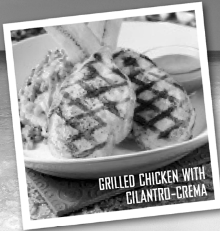
GRILLED CHICKEN WITH CILANTRO-CREMA