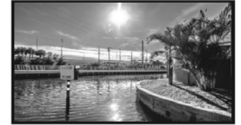
3901 Doral Drive DANA SHORES

Waterfront, fully renovated, almost 2,500sqft, 4b/2ba + Office + Pool. $599,000