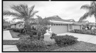
9858 Gingerwood Dr. WESTCHASE

3b/2ba/2cg, fully renovated, luxury villa in a gated community. $325,000