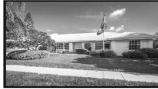
7112 Pelican Island Dr. PELICAN ISLAND

2,600+ sqft home — gated community. 4b/2.5ba/2cg + POOL! $420,000