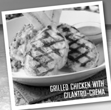
GRILLED CHICKEN WITH CILANTRO-CREMA

LIGHT, FRESH CUISINE IN A DELICIOUSLY LAID-BACK ATMOSPHERE.