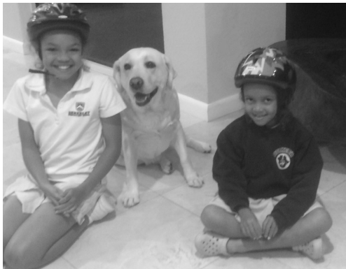
Two neighborhood residents and one neighborhood pup pose for a picture at our first Dana Shores helmet fitting event.

Last year we polled our residents to gauge interest in free bicycle helmets. Based on the positive response, we applied for a grant and neighborhood volunteers received training as fitters.