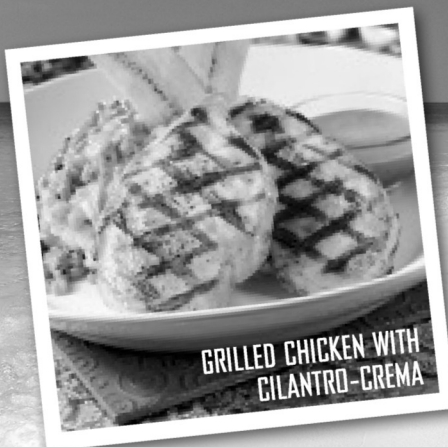
GRILLED CHICKEN WITH CILANTRO-CREMA

LIGHT, FRESH CUISINE IN A DELICIOUSLY LAID-BACK ATMOSPHERE.