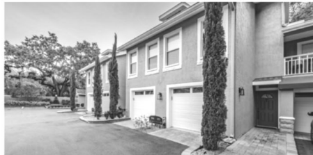
SOUTH TAMPA 2 BED | 2.5 BATH | 1,519 SF | $425,000 4811bayshoreboulevard303.smithandassociates.com