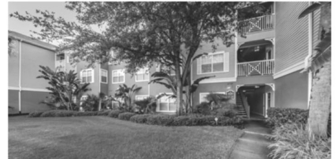
SOUTH TAMPA 2 BED | 2 BATH | 1,116 SF | $199,500 4207southdalemabryhighway4107.smithandassociates.com