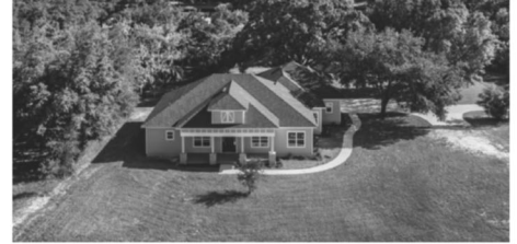
LUTZ 4 BED | 3/1 BATH | 3,084 SF | $599,000 17107fordelsollane.smithandassociates.com