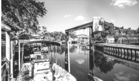
DAVIS ISLANDS (TAMPA) 4 BED | 3.5 BATH | 3,913 SF | $1,495,000 581 Marmora Avenue - CANAL FRONT!