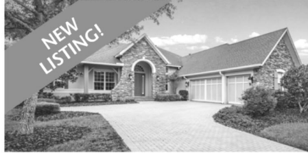
WATERCHASE 4 BED | 4 BATH | 4,253 SF | $679,900 14603tudorchasedrive.smithandassociates.com