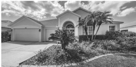
WESTCHASE 4 BED | 3 BATH | 2,745 SF | $525,000 11906middleburydrive.smithandassociates.com