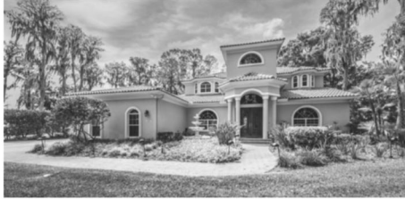
LAKE MAGDALENE 4 BED | 3.5 BATH | 4,027 SF | $1,078,485 15521lakemagdaleneboulevard.smithandassociates.com