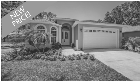
COUNTRYWAY AREA 3 Bed | 2 Bath | 1,968 SF | $329,500 11404memorialhighway.smithandassociates.com

#33626zipcode #westchase #tamparealestate #tampa #florida #southtampa #lakemagdalene #smithsells #thewoodteam #floridaliving #smithandassociates #thewoodteamsells #newconstruction