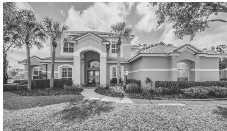
WESTCHASE 4 Bed | 3/1 Bath | 3,731 SF | $749,000 12306marbleheaddrive.smithandassociates.com