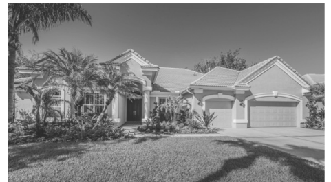
WESTCHASE 4 Bed | 4/1 Bath | 4,195 SF | $749,500 11807marbleheaddrive.smithandassociates.com