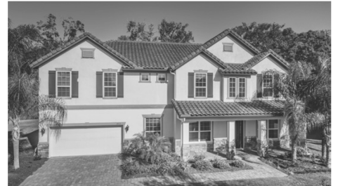
LAKE MAGDALENE AREA 5 Bed | 4 Bath | 4,392 SF | $650,000 1803bellacasacourt.smithandassociates.com