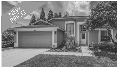
WESTCHASE 4 Bed | 3 Bath | 1,884 SF | $357,700 11832easthamptonsdrive.smithandassociates.com