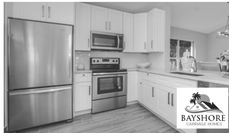
SOUTH TAMPA 3 Bed | 2 Bath | 1,602 SF | starting at $375,000 4811bayshoreboulevard.smithandassociates.com