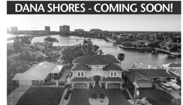
DANA SHORES - COMING SOON!

DANA SHORES 3908 W. EDEN ROC CIRCLE 3 Bed | 3 Bath | 2,532 SF FULLY renovated on wide SALTWATER canal. NEW Kitchen, ROOF, 10KLB lift & Dock, HVACs.