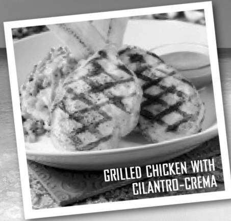
GRILLED CHICKEN WITH CILANTRO-CREMA

LIGHT, FRESH CUISINE IN A DELICIOUSLY LAID-BACK ATMOSPHERE.