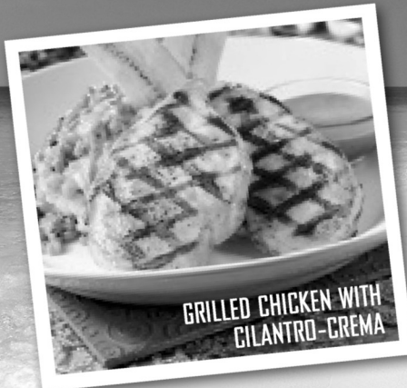
GRILLED CHICKEN WITH CILANTRO-CREMA

LIGHT, FRESH CUISINE IN A DELICIOUSLY LAID-BACK ATMOSPHERE.