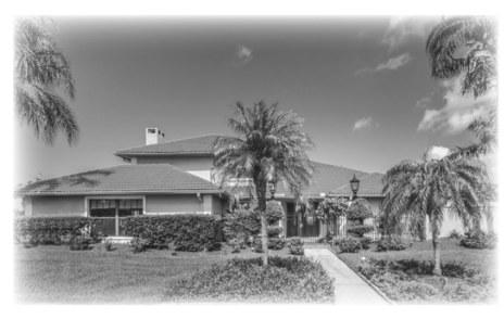
PELICAN ISLAND $599,000 7138 Pelican Island Drive

2015 Built David Weekley Beauty! Contemporary POOL/SPA with fenced backyard, on a corner 1/2 acre lot! 5 bed/4 1/2 bath/3 car garage – 4,195 sqft. Located in the GATED community of Old Memorial Estates near Ed Radice Park.