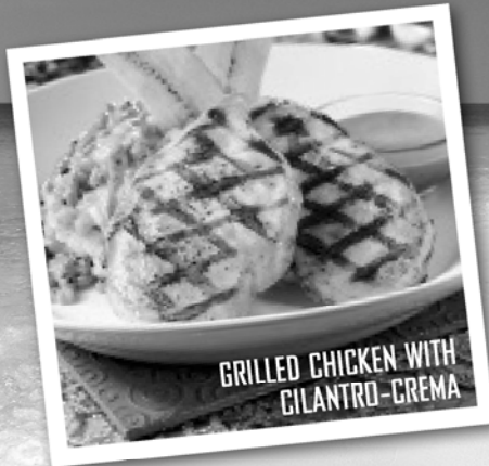
GRILLED CHICKEN WITH CILANTRO-CREMA

LIGHT, FRESH CUISINE IN A DELICIOUSLY LAID-BACK ATMOSPHERE.