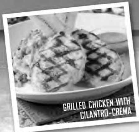
GRILLED CHICKEN WITH CILANTRO-CREMA

LIGHT, FRESH CUISINE IN A DELICIOUSLY LAID-BACK ATMOSPHERE.