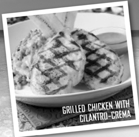
GRILLED CHICKEN WITH CILANTRO-CREMA