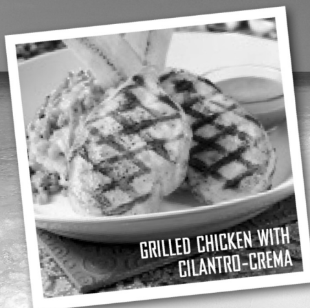
GRILLED CHICKEN WITH CILANTRO-CREMA

LIGHT, FRESH CUISINE IN A DELICIOUSLY LAID-BACK ATMOSPHERE.